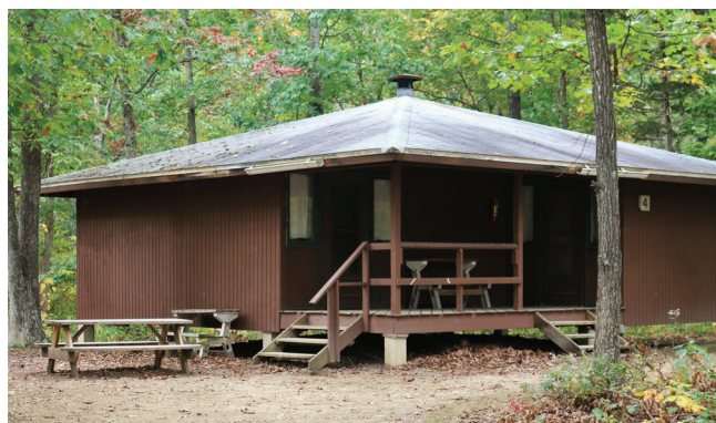
Cabin with Toilet/Sink and Bunks