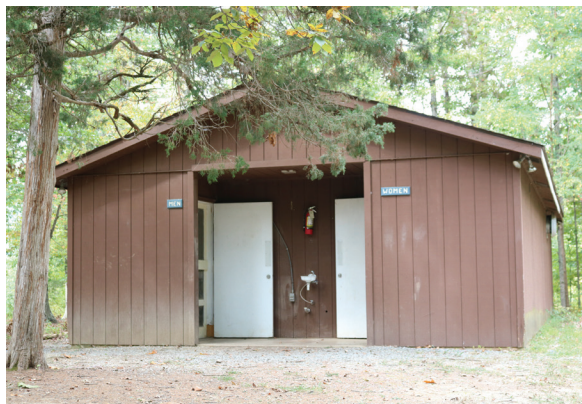
Sukkah Village Bathhouse