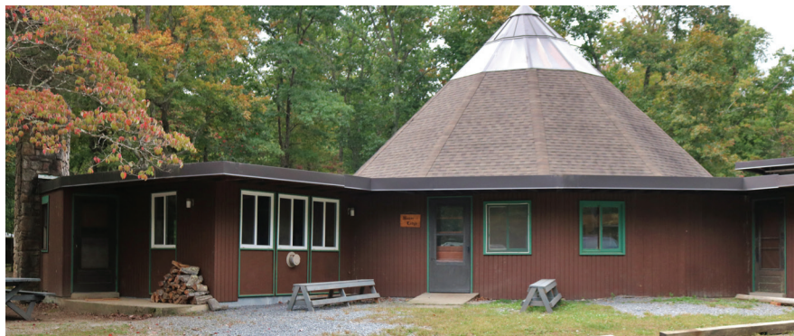
Sukkah (screened cabin) with Cots